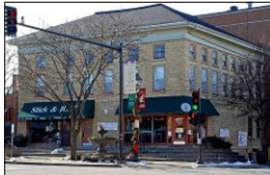
Historic Babcock's Grove Hotel—built in 1858! (SW corner of Park and St. Charles)